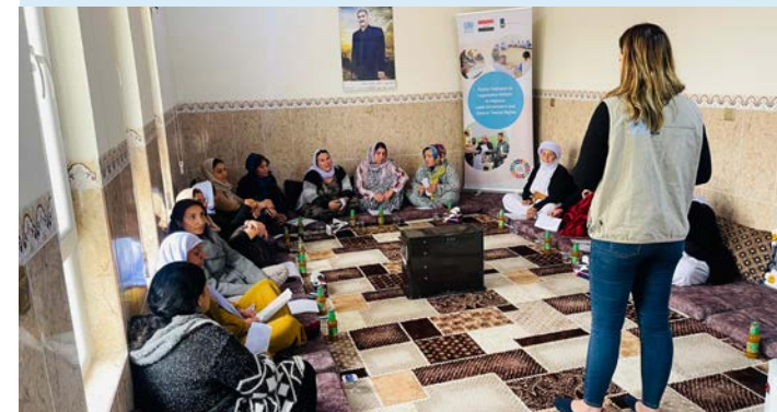
Awareness raising on housing, land and property (HLP) rights in Sinjar, Iraq.