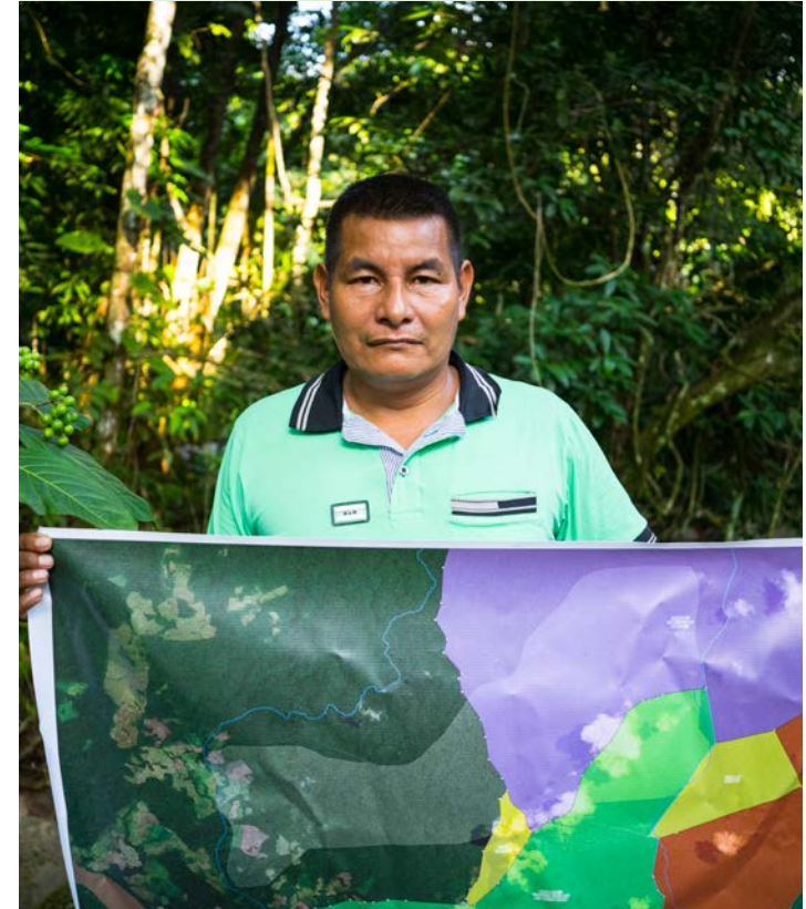
Community mapping of the reserves in Solano, Colombia.

Kadaster International, Tropenbos and ICCO Conexión