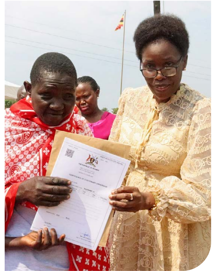
Ugandan Minister for Lands, Housing and Urban Development hands over a Certificate of Customary Ownership to a blind lady and her daughter in Butaleja district.