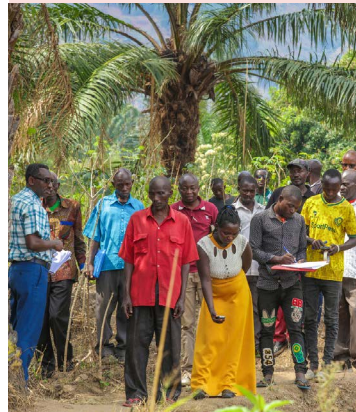
Measuring plots of land, with community members as witnesses in Nyanza-Lac, Burundi.

ZOA, VNG International, MiPAREC and LADEC