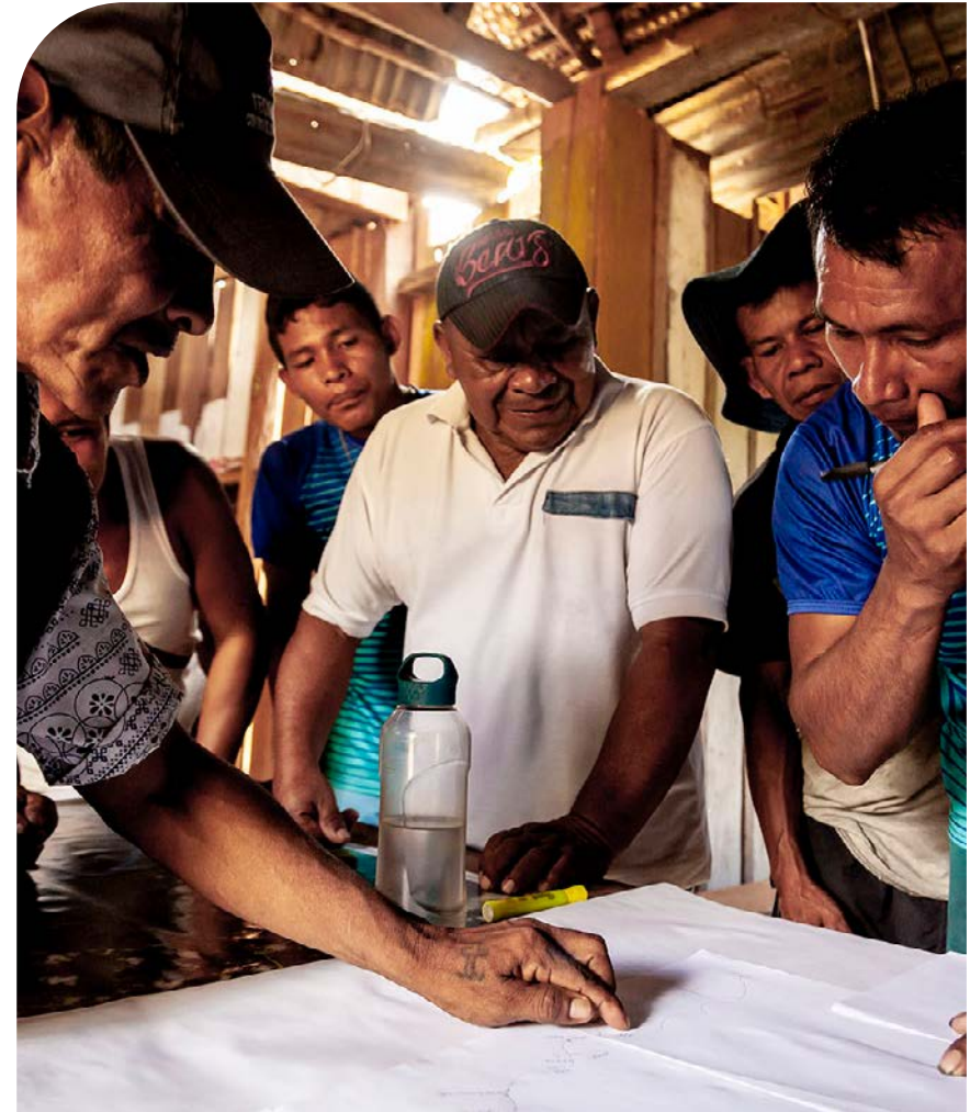
Community mapping of the resguardos in Solano , Colombia. (Liliana Merizalde Caquetá, 2022)