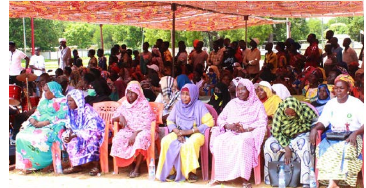
Campaign for women's land rights in Chad.

Oxfam Intermon, FAO, and Kadaster International