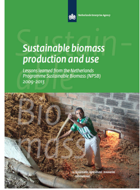
The experiences developed by NPSB have resulted in a report with lessons learned and key recommendations along the biomass value chain (http://bit.ly/nt6gLk).