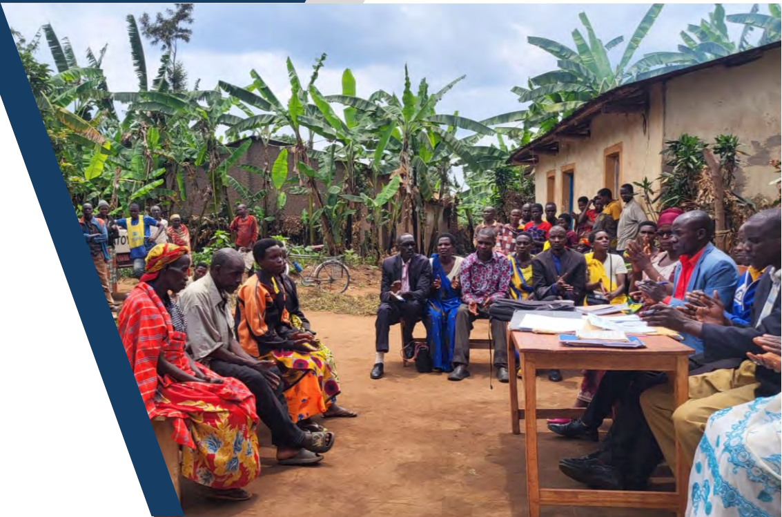
LAND-at-scale Burundi, 2025